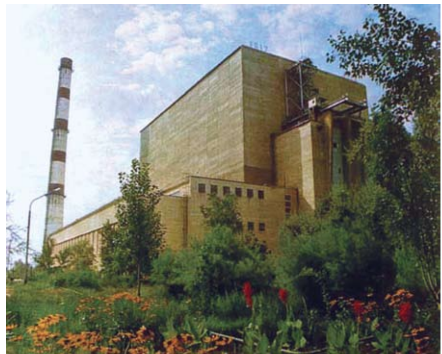
International Nuclear Safety, Pacific Northwest National Laboratory

When natural uranium (U-238) is enriched, to concentrate the fissile isotope, U-235 to a few percent, only a small percentage of the natural uranium is used. As an example, for the 23.2 GW of current nuclear capacity in Russia, 3,800 tons of natural uranium must be mined or taken out of stocks per year. After enrichment, a little more than 600 tons of fuel are created, with the remaining 3,200 tons left as "enrichment tails," or depleted uranium. In Russia, uranium enrichment tails are accumulating at a rate of about 4,000 tons per year. These tailings can be enriched, as an additional source of reactor fuel.